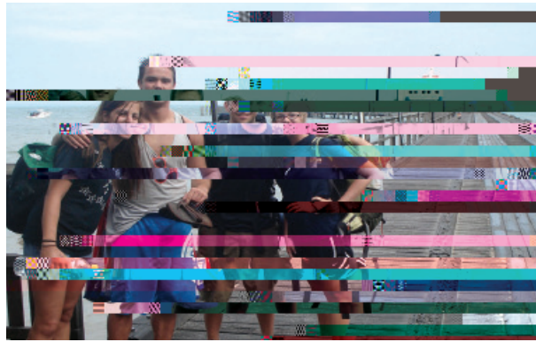
Hiking the world's largest sand island, Australia

Located in the state of Victoria on the southeastern tip of Australia, Deakin University offers three different campuses for study opportunities. Students may enroll in a wide variety of regular university courses in liberal arts, architecture, business, education, fisheries & wildlife, nutrition, exercise & sports science, mechanical engineering, construction engineering, and more. Deakin University is one of Australia's most progressive universities, and has twice won the prestigious University of the Year award.