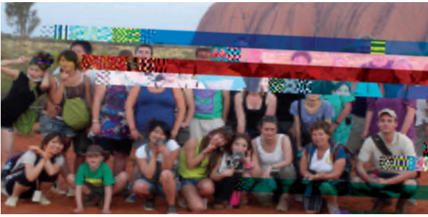
Uluru in the outback, Australia

Hundreds of subjects are available for you to choose from, including areas as diverse as coral reef ecology, rainforest science, indigenous Australian studies, digital arts, media arts, sport and exercise science, and liberal arts, just to name a few! Most locations also offer field trips and excursions available upon sign up.